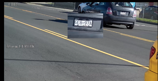
Vehicle from lane 4 with visible back tag captured during the day