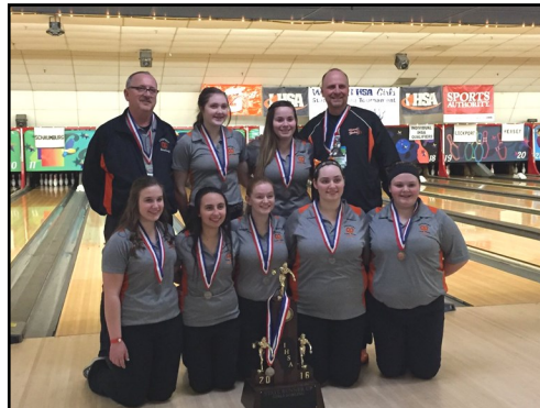
The FHS Pretzel Girls' Bowling Team placed 2nd at the IHSA State Tournament on February 19th & 20th in Rockford. Congratulations on a great season, ladies!